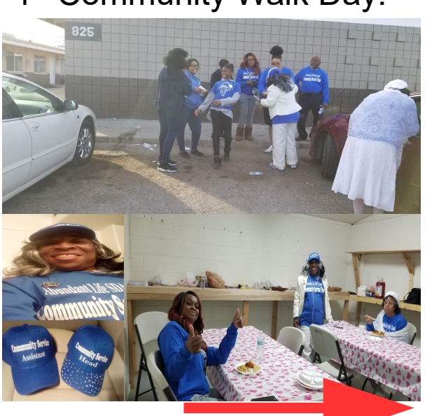
Turn over page 2