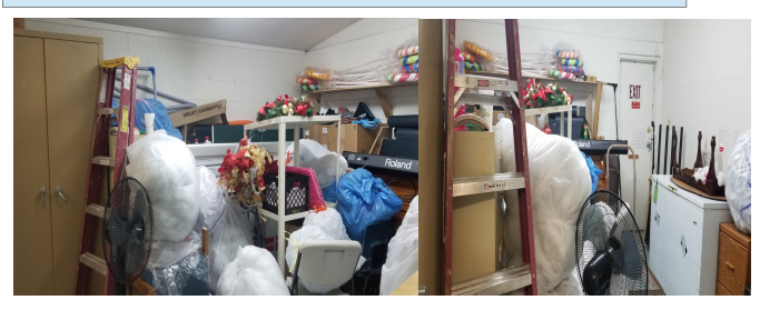
Clean up day- BEFORE

Suryea for volunteering to make our thank you cards! Pathfinders for joining us with the community walk! Brother Lawrence Rawls for the truck load of noodles! Sister Pat Everson for donating all the shelving! Pastor Chad for helping with the loading and unloading!